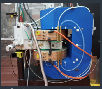
Penning ion source under test